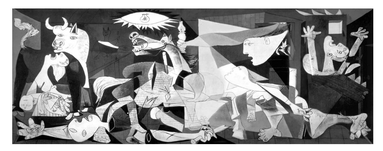
Figure 2.1: Pablo Picasso, Guernica, 1937, oil on canvas, 11 ft 5 in x 25 ft 6 in, Museo Reina Sofia, Madrid, Spain.

While Tillich believed that the greatest religious art of the twentieth century was produced by expressionist painters, he considered Picasso's Guernica , figure 2.1, a prime