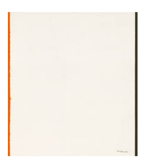
Figure 3.3: Barnett Newman, Be II , [Resurrection] 1961/1964, acrylic and oil on canvas, 78 in x 60 1/16 in, National Gallery of Art, Washington, D.C.

Taylor also sees Newman as a painter who is enthralled with nothingness. Newman finds nothingness intriguing and requiring investigation. The Stations series is one of Newman's investigations of nothingness. Finding out the secret depths of nothingness is a difficult task. As Taylor states: "This task, however, was more difficult than it first appeared. 'Emptiness,' Newman discovered, 'is not that easy. The point is to produce it.'" Taylor sees Newman's investigation of nothingness in making the canvases of the Stations in theological terms. He writes: "Newman followed in the footsteps of Aphaeretic negative theology. Through the process of abstraction, Newman also moved from volume to plane to line to point. The will-to-abstraction is a will-to-purity, which in turn is a will-to-immediacy." Taylor underscores the philosophical and theological aspects of Newman's painting techniques and materials choices used in